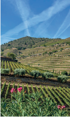
VINHA DA ESCOLA

from its intensely dark coloured berries. The Sousão and Alicante Bouschet from the Escola vineyard have become signature varieties for Capela do Vesuvio and are the perfect counterpoint to the Touriga Nacional and Touriga Franca varieties.