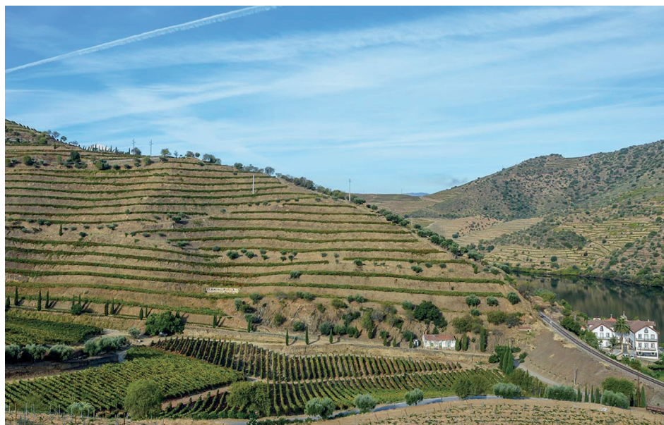
LOWER FOREGROUND, THE VINHA DA ESCOLA VINEYARD

Over the last 20 years, two of the lesser-known varieties in the Douro; Sousão and Alicante Bouschet have gained importance at Quinta do Vesuvio. This follows a long tradition of viticultural innovation at the property, which was one of the first in the region to plant varietal vineyards in the 1970s. Sousão maintains tremendous freshness and acidity even in the hottest years in the Douro, and again it proved its worth in 2016. Alicante Bouschet adds structure and length, and has equally proven its worth, contributing weight and colour