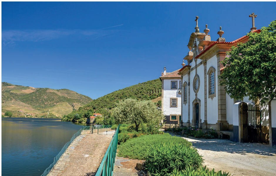
THE QUINTA DO VESUVIO CHAPEL ('CAPELA'), FACING THE DOURO RIVER